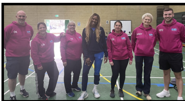
Hertfordshire School Games Organisers

We do hope you enjoy reading this edition of School Games Hertfordshire's e-newsletter, celebrating the Autumn Term 2022.